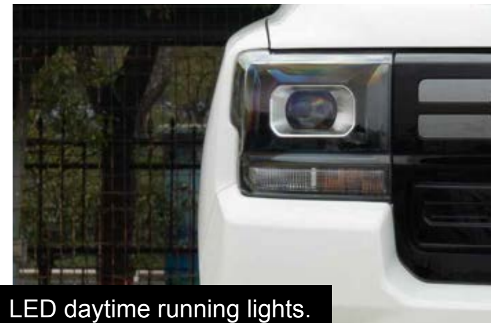
LED daytime running lights.