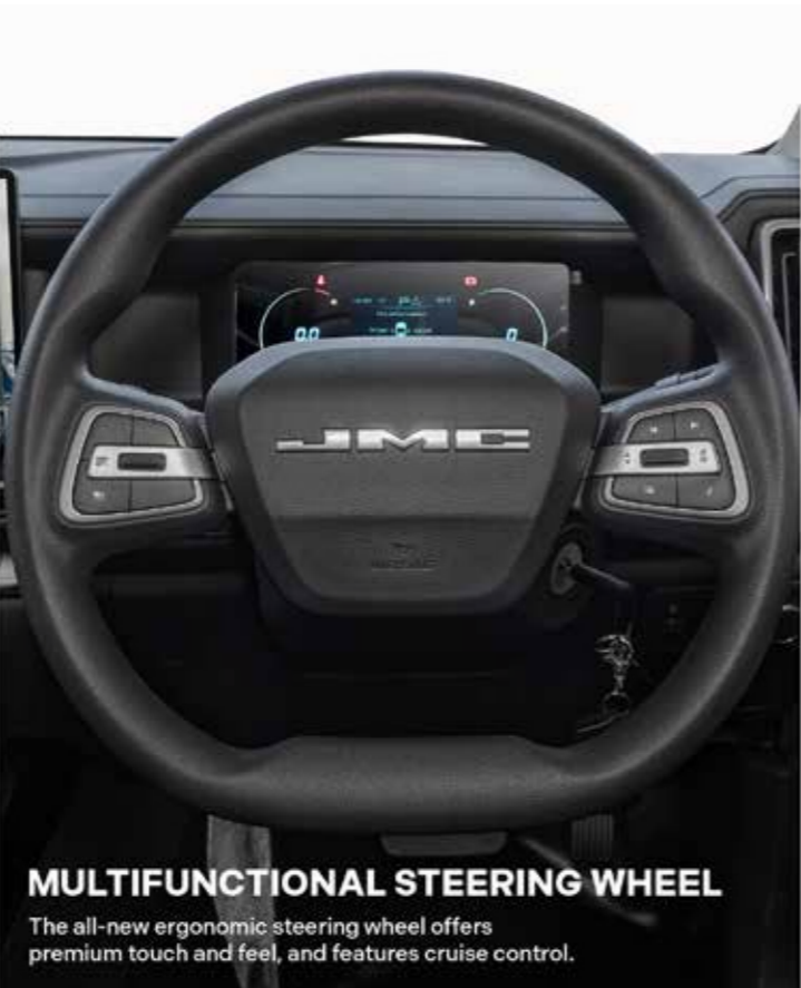
MULTIFUNCTIONAL STEERING WHEEL The all-new ergonomic steering wheel offers premium touch and feel, and features cruise control.