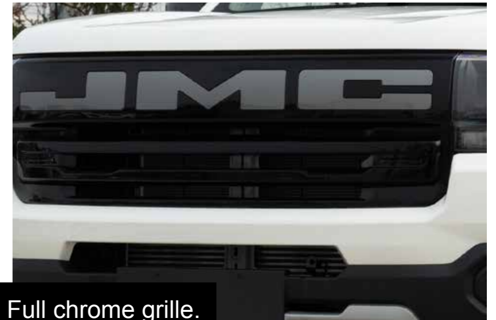
Full chrome grille.