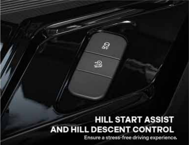
HILL START ASSIST AND HILL DESCENT CONTROL Ensure a stress-free driving experience.