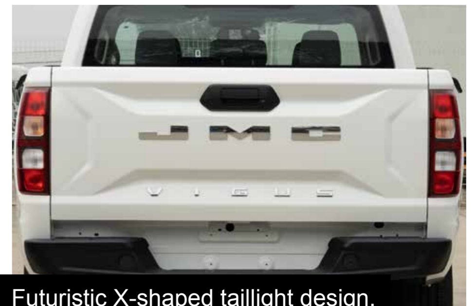
Futuristic X-shaped taillight design.