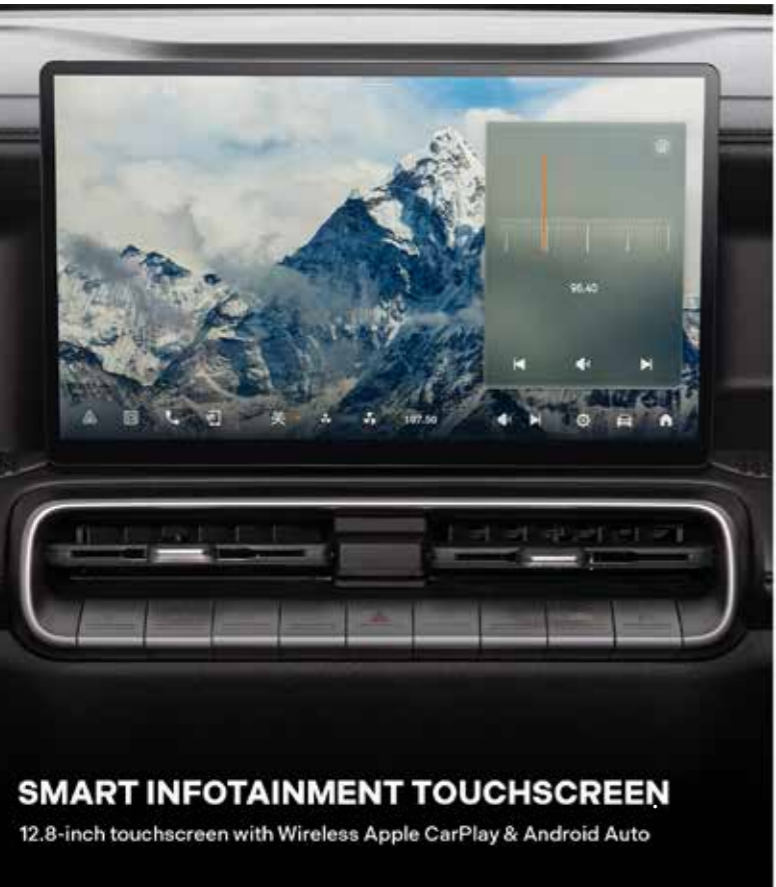
SMART INFOTAINMENT TOUCHSCREEN 12.8-inch touchscreen with Wireless Apple CarPlay & Android Auto