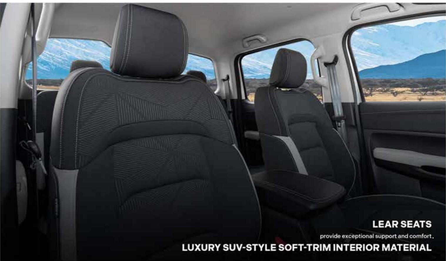
LEATHER SEATS provide exceptional support and comfort. LUXURY SUV-STYLE SOFT-TRIM INTERIOR MATERIAL